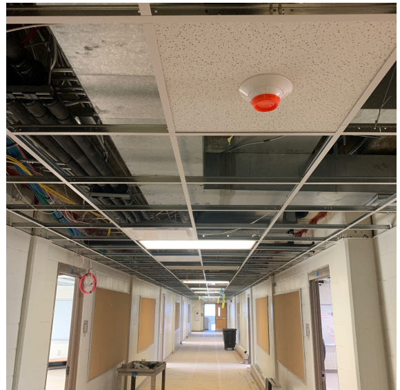
Corridor Ceiling Grid and Device Installation