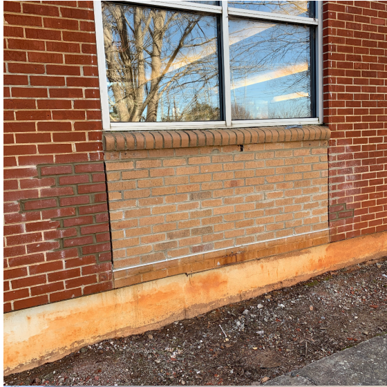
Exterior Brick Infill at Cafeteria