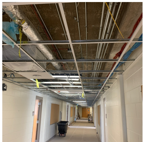
Corridor Ceiling Ceiling Grid Install