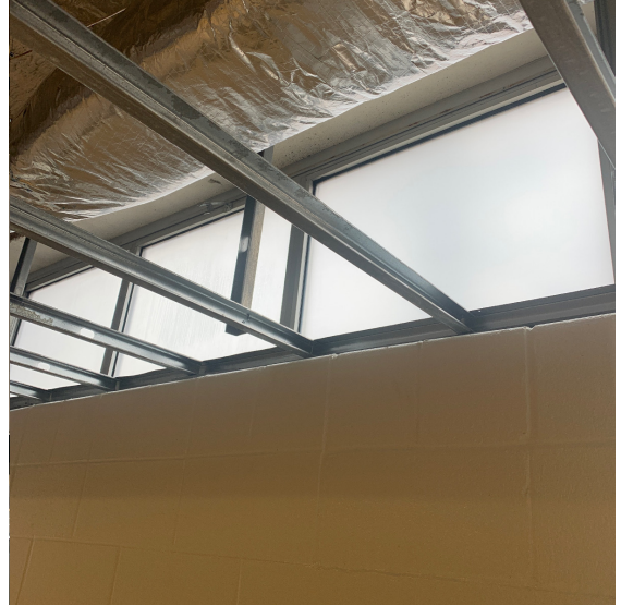
Window Frost Film Install