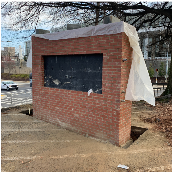
Monument Sign Brick Install