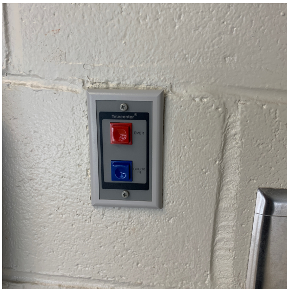
Intercom Device Installation